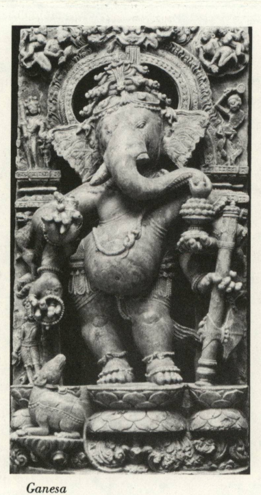
Orissa State Museum, Bhubaneswar

To inaugurate the "Festival of India" across the United States—a series of artistic events in 1985-1986 illuminating the history and culture of India—the National Gallery of Art will exhibit more than 100 pieces of sculpture. These works, in stone, ivory, and bronze, and ranging in size from the miniature to the monumental, will present the rich diversity of Indian sculpture, which has rarely been glimpsed in the United States.