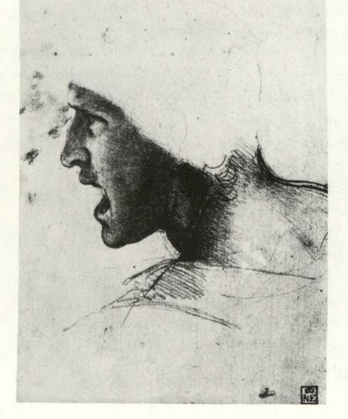
LEONARDO DA VINCI. Study of a Warrior's Head Museum of Fine Arts, Budapest