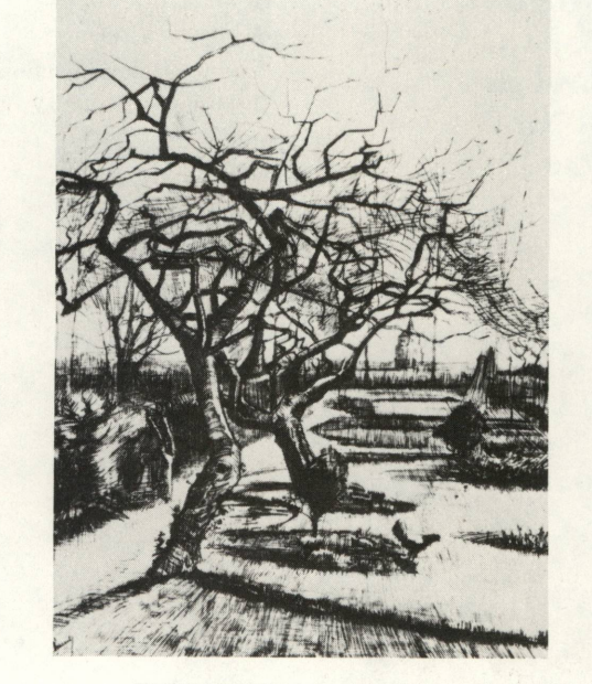
VAN GOGH. Winter Garden in Nuenen Museum of Fine Arts, Budapest

One hundred of the finest European drawings from the Museum of Fine Arts, Budapest, go on view in the largest exhibition ever lent by that museum. Presented chronologically, the exhibition carries through the nineteenth century. Artists represented in the exhibition include Leonardo, Raphael, Dürer, Correggio, Rembrandt, Poussin, Watteau, Delacroix, Daumier, Seurat, Cézanne, and van Gogh. The exhibition has been supported by a grant from Occidental Petroleum Corporation.