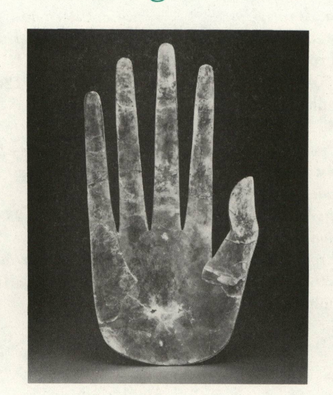
OHIO HOPEWELL CULTURE. Hand-Shaped Cutout