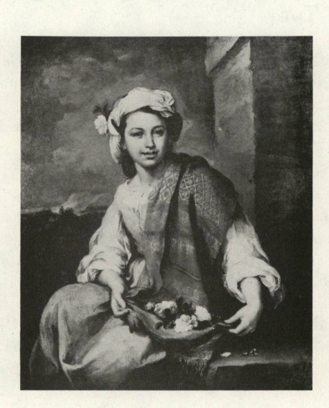
MURILLO. The Flower Girl The Dulwich Picture Gallery, London