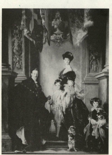
SARGENT. The 9th Duke of Marlborough and His Family The Duke of Marlborough Blenheim Palace, Oxfordshire

Treasure Houses of Britain: Five Hundred Years of Private Patronage and Art Collecting will focus on the British Country House as a "vessel of civilization." It will bring together more than 700 works of art illustrating the extraordinary achievement of collecting and patronage in houses throughout Britain over half a millenium. Their Royal Highnesses The Prince and Princess of Wales are Patrons of the exhibition. The exhibition is made possible by a generous grant from the Ford Motor Company.