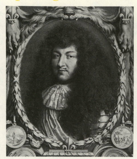
NANTEUIL. Louis XIV National Gallery of Art Rosenwald Collection