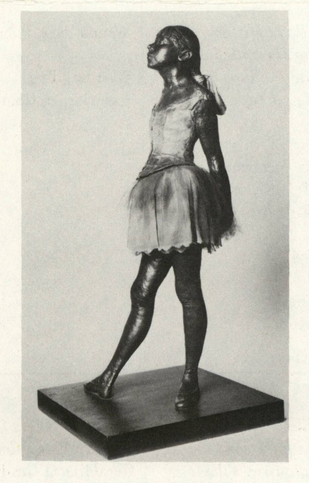
DEGAS. Little Fourteen-Year-Old Dancer Virginia Museum of Fine Arts, Richmond

This exhibition focuses on 151 masterworks of prehistoric native American art executed between the Late Archaic and Mississippian periods (3000 B.C.-A.D. 1500) in the woodlands area of the southeast and midwest of North America. These stone, shell, and copper artifacts are significant not only as cultural and archaeological objects, but also as works of art. The exhibition has been organized by The Detroit Institute of Arts.