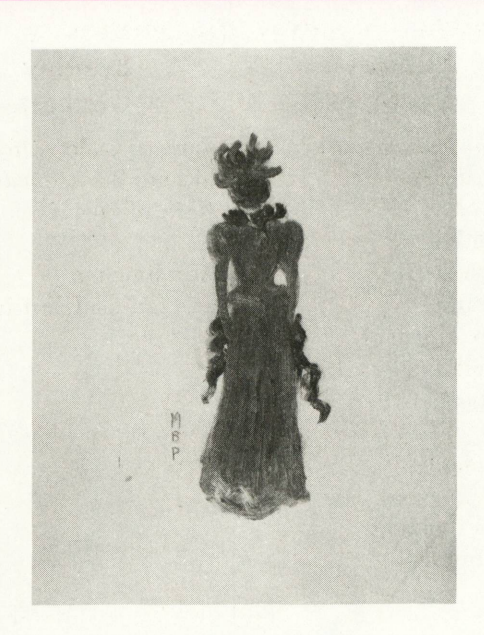
PRENDERGAST. Green Dress Daniel J. Terra Collection Terra Museum of American Art