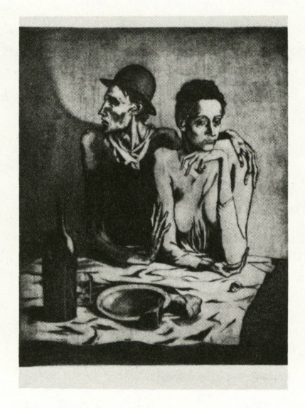
PICASSO. The Frugal Repast Private Collection

Through March 3, 1985 Ground Floor Galleries West Building