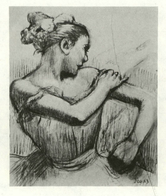
DEGAS. Dancer (Danseuse) Kunsthalle, Bremen

A recorded tour of Degas: The Dancers is available at the entrance to the exhibition.