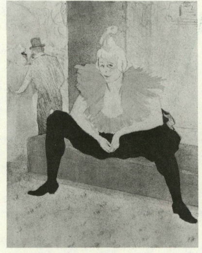
TOULOUSE-LAUTREC. The Seated Clowness Private Collection

This exhibition surveys the history of graphic art with prints of exceptional quality by major artists from the fifteenth century to the present, including works by Dürer, Rembrandt, Piranesi, Manet, Degas, Toulouse-Lautrec, Munch, Picasso, and Kirchner. Ninety of the finest prints in Washington area private collections are on view.