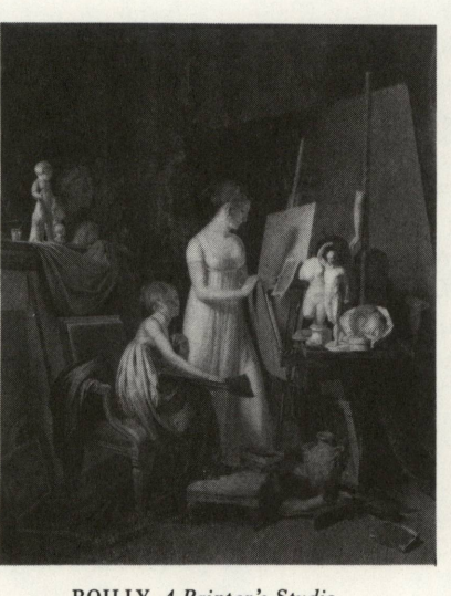
BOILLY. A Painter's Studio National Gallery of Art Chester Dale Collection 1943

The Education Department is pleased to announce a new lecture series entitled The Great Styles of Western Art. This ten-week series of free public lectures will begin on Tuesday, October 2, and Wednesday, October 3. The slide lectures will investigate the idea of style in the Western tradition and define the visual characteristics of each of the major period styles. The lectures will be presented each Tuesday at 10:30 a.m. in the East Building Auditorium. The lectures will be repeated on Wednesdays at 12:30 p.m. in the West Building Lecture Hall. Please call the Education Department (202/842-6246) for additional information.