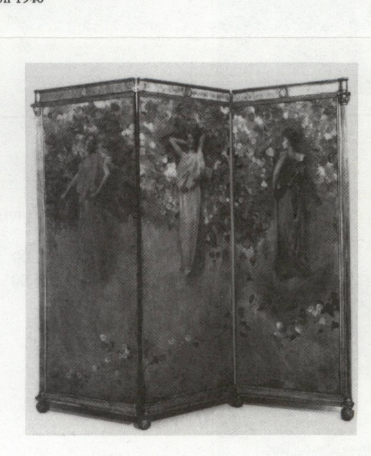
THOMAS DEWING. Morning Glories Museum of Art, Carnegie Institute

Through July 8, 1984 Ground Floor Galleries West Building