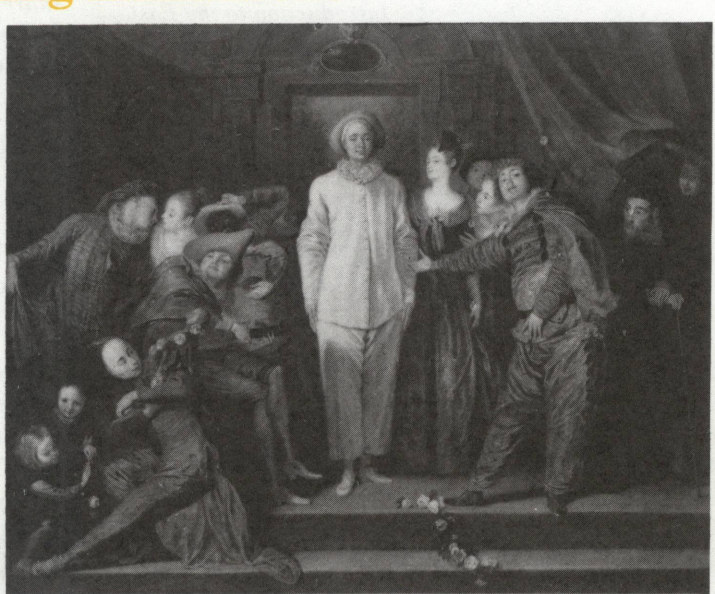
WATTEAU. The Italian Comedians National Gallery of Art, Samuel H. Kress Collection 1946