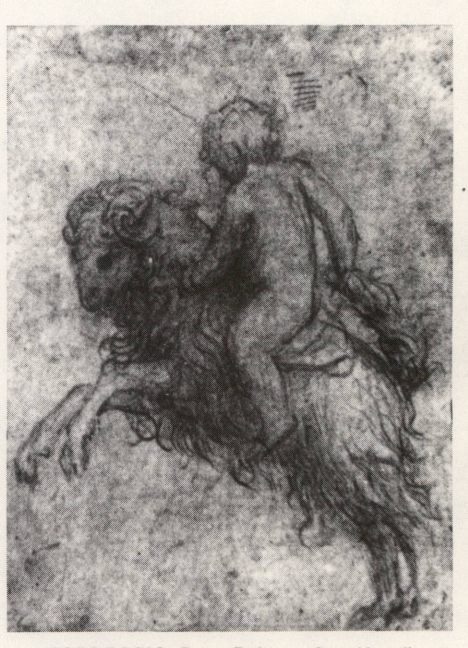
CORREGGIO. Putto Riding a Goat (detail) Galleria e Museo Estense, Modena

Through May 13, 1984 Ground Floor Galleries West Building