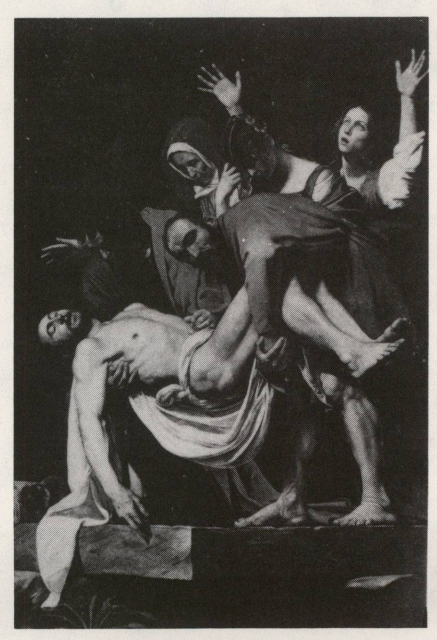
CARAVAGGIO. The Deposition Pinacoteca, The Vatican Collections

Through April 29, 1984 Lobby A West Building