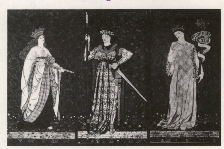
WILLIAM MORRIS. Three-panel Screen The Castle Howard Collection