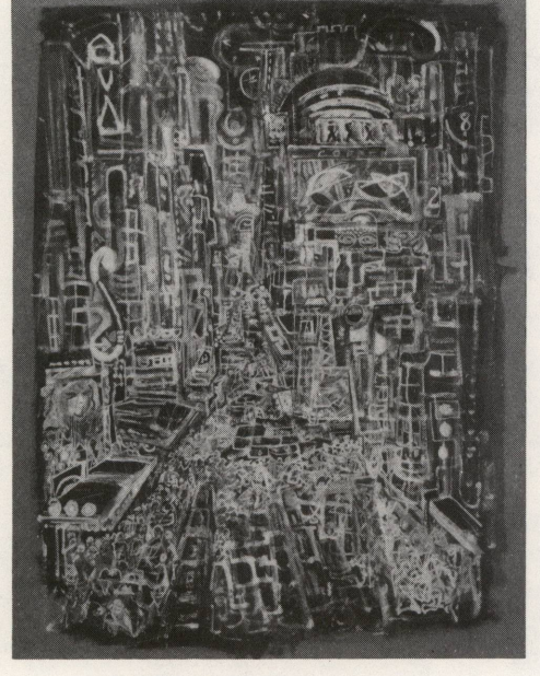
TOBEY. Broadway The Metropolitan Museum of Art

The exhibition has been generously supported by contributions from Bankers Trust Company and Goldman, Sachs & Co. It will subsequently be seen at the Yale University Art Gallery (October 11, 1984-January 6, 1985).