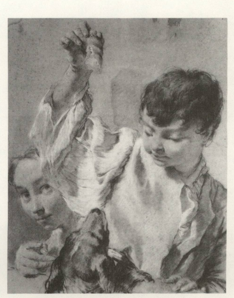
PIAZZETTA. Young Boy Feeding a Dog The Art Institute of Chicago, Helen Regenstein Collection

Through February 26, 1984 Ground Floor Galleries West Building