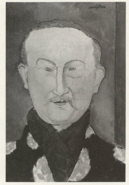
MODIGLIANI. Léon Bakst National Gallery of Art, Chester Dale Collection 1962

Leonardo's Last Supper: Before and After is made possible by Olivetti. The exhibition, under the special patronage of President Sandro Pertini of the Republic of Italy and President Ronald Reagan, makes its only U.S. appearance at the National Gallery.