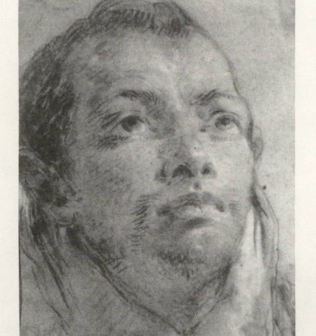
TIEPOLO. Head of a Young Man Ian Woodner Collection

Other highlights of the exhibition include Landscape at Cagnes, one of only four landscapes painted by Modigliani; examples of the numerous female nudes which he painted in 1917 and 1918; and a selection of drawings which provide a rare opportunity to study Modigliani's working methods.