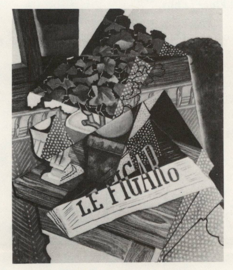
JUAN GRIS. The Pot of Geraniums

Through December 31, 1983 Concourse Level East Building