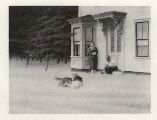
EDWARD HOPPER. Cape Cod Evening National Gallery of Art, John Hay Whitney Collection 1982

Through November 27, 1983 Upper Level and Mezzanine East Building