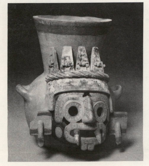
Tlaloc Effigy Vessel

Through January 8, 1984 Upper Level East Building