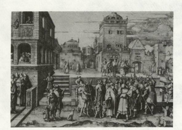
LUCAS VAN LEYDEN. The Large Ecce Homo Staatliche Museen, Berlin