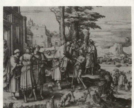
LUCAS VAN LEYDEN. Return of the Prodigal Son The Cleveland Museum of Art

Through August 14, 1983 Ground Floor Galleries West Building