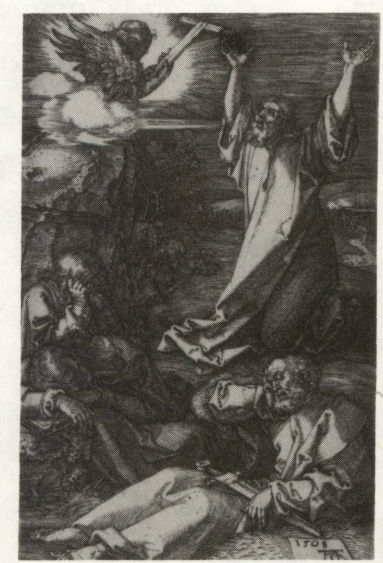
ALBRECHT DURER. The Agony in the Garden National Gallery of Art, Rosenwald Collection

Through October 9, 1983 Ground Floor Galleries West Building