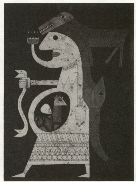
VICTOR BRAUNER. Là-Bas (Over Yonder) D. and J. de Menil Collection

Through September 28, 1983 Concourse Level East Building