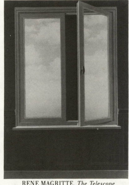
RENE MAGRITTE. The Telescope Menil Foundation Collection