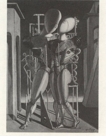
GIORGIO DE CHIRICO. Hector and Andromache. Menil Collection

This exhibition focuses on renderings of darkness and dramatic contrasts of light and dark in graphic works dating from the sixteenth to the twentieth century, drawn primarily from the National Gallery's permanent collection. One hundred prints are on view. Among the masters represented are Rembrandt, Goya, Delacroix, Degas, Whistler, Bellows, and Sloan.