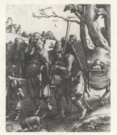
LUCAS VAN LEYDEN. The Beggars Musée du Petit Palais, Paris