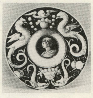
Dish National Gallery of Art Widener Collection