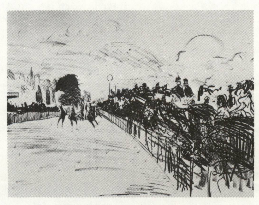
The Races at Longchamp EDOUARD MANET The New York Public Library

A lecture in conjunction with the exhibition will be given on Sunday, October 10. Please see reverse side for specific information.