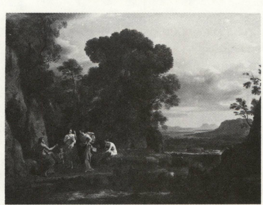
The Judgment of Paris CLAUDE LORRAIN National Gallery of Art Ailsa Mellon Bruce Fund