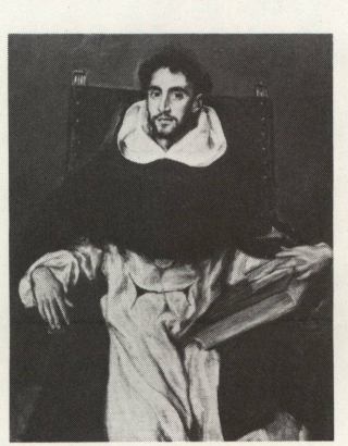
Fray Hortensio Felix Paravicino EL GRECO Museum of Fine Arts, Boston