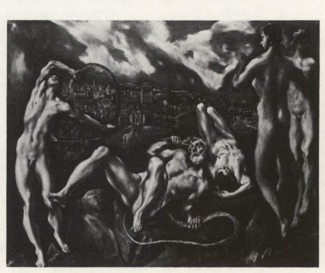
Laocoön EL GRECO National Gallery of Art Samuel H. Kress Collection