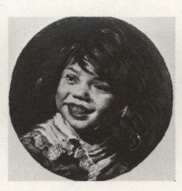
Head of a Young Boy FRANS HALS Mauritshuis, The Hague