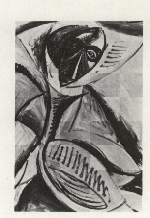
Nude with Arms Raised PABLO PICASSO The Thyssen-Bornemisza Collection

Through September 6, 1982 Upper level and Mezzanine East Building