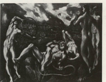
Laocoön EL GRECO National Gallery of Art Samuel H. Kress Collection

El Greco of Toledo has been organized by The Toledo Museum of Art, Ohio, with the Museo del Prado, Madrid, Spain; the National Gallery of Art, Washington; and the Dallas Museum of Fine Arts, Texas.