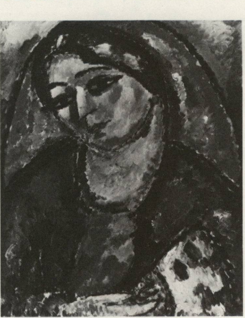
The Red Veil ALEXEJ VON JAWLENSKY The Thyssen-Bornemisza Collection

The exhibition will travel to the Wadsworth Atheneum, Hartford; The Toledo Museum of Art; the Seattle Art Museum; the San Francisco Museum of Modern Art; and The Metropolitan Museum of Art, New York.