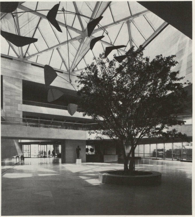
East Building central courtyard