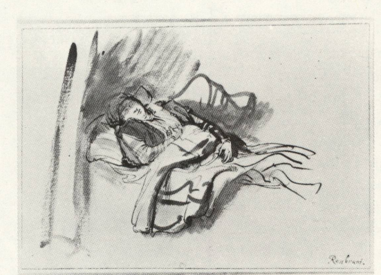
Saskia Sleeping in Bed REMBRANDT VAN RIJN The Ashmolean Museum, Oxford

Over 100 figure drawings and watercolors by Rembrandt van Rijn, Hendrick Avercamp, Hendrick Goltzius, Willem Buytewech, Adriaen van Ostade, and other 17th-century Dutch artists constitute the first exhibition devoted specifically to this subject. Organized