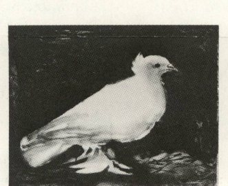
The Dove. PICASSO The Morton G. Neumann Family Collection