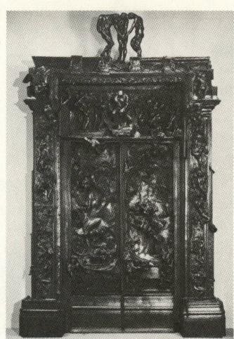
The Gates of Hell. RODIN