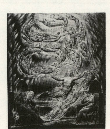
Queen Katherine's Dream. BLAKE National Gallery of Art Lessing J. Rosenwald Collection