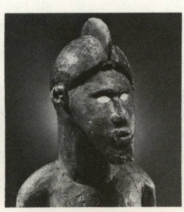
Nsiba (detail) Private Collection

Represented in this exhibition are 59 examples of funerary art from the Central African civilization of Kongo in Bas-Zaïre.