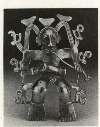
Pendant, costumed figure Banco Central de Costa Rica