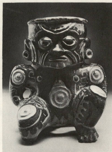
Anthropomorphic-effigy vessel Museo Nacional de Costa Rica

Dating from c. 500 B.C. to the mid-16th century A.D., the ceremonial, decorative, and utilitarian objects include pendants and other ornaments in finely wrought gold and elegantly carved jade, richly colored and incised ceramic jars and vessels, and large stone sculptures of warriors and other figures, as well as curved