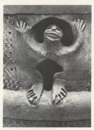
Diboondo (detail). Institut des Musées Nationaux du Zaïre, Kinshasa

Through January 17, 1982 Ground floor East Building