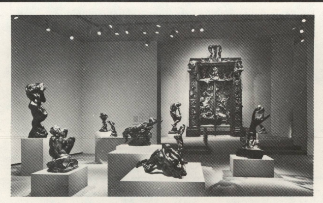
Installation view of "The Gates of Hell and Their Offspring"

This exhibition of almost 400 examples of sculpture, drawings, and photographs is the largest ever devoted to the art of the French sculptor Auguste Rodin (1840-1917). Arranged in ten thematic sections, the exhibition is installed on all floors of the East Building, beginning on the Upper level.