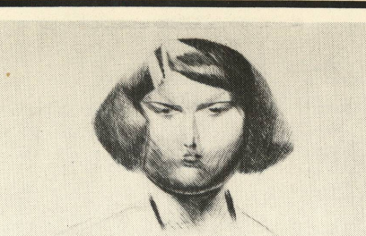
Rénée as Seen Full Face (detail) VILLON National Gallery of Art Ailsa Mellon Bruce Fund

October 18, 1981, through January 3, 1982 Ground level East Building