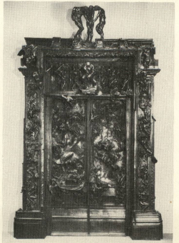
The Gates of Hell. RODIN B.G. Cantor Collections

This exhibition is the largest ever devoted to the art of the great French sculptor Auguste Rodin (1840-1917). Almost 400 examples of sculpture, drawings, and photographs are arranged in ten thematic sections. The exhibition begins on the Upper level with a re-creation of a Paris sculpture salon of the 1870s. The visitor should then proceed downward to the Mezzanine, Ground, and Concourse levels.