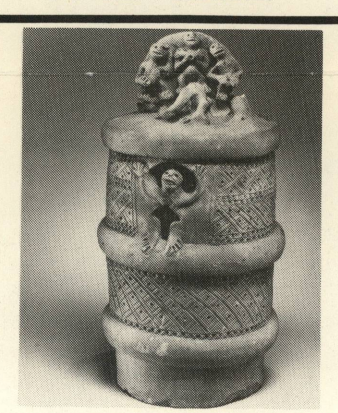
Diboondo Institut des Musées Nationaux du Zaïre, Kinshasa

Through January 17, 1982 Ground floor East Building