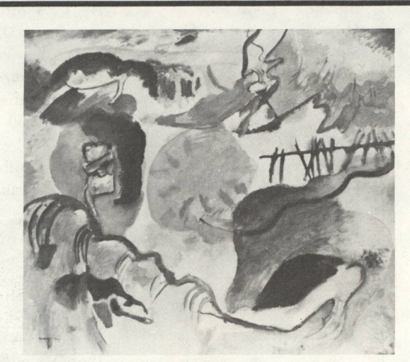
Improvisation 27 (Garden of Love). KANDINSKY The Metropolitan Museum of Art The Alfred Stieglitz Collection

Through September 7 Mezzanine level East Building