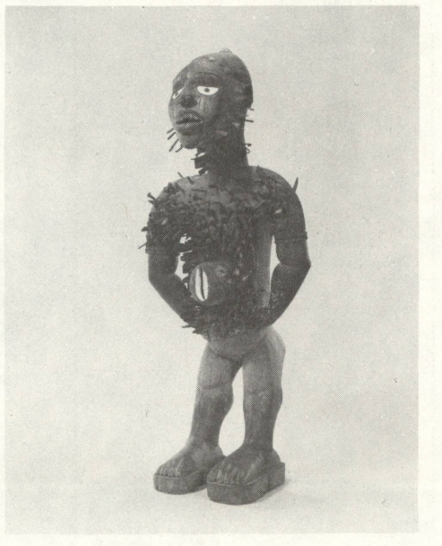
Nkisi-n'kondi The Detroit Institute of Arts

The four cardinal points of the sun's cosmic journey—dawn, noon, sunset, and midnight (when, according to Kongo beliefs, the sun is shining on the kingdom of the dead)—comprise the prime Kongo emblem denoting spiritual cycles and rebirth. The exhibition offers 58 examples of Kongo art bearing this emblem and other symbols and human gestures related to it. Included are objects and figures in stone, wood, and cloth as well as richly incised terra-cotta grave-markers never before presented in North America.