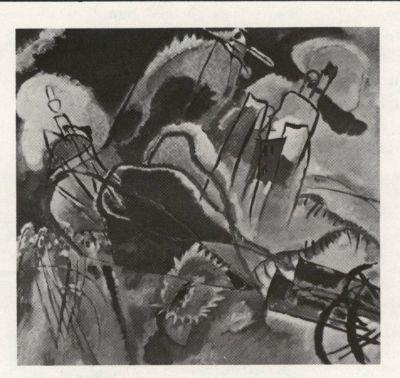
Improvisation 30 (Cannon). KANDINSKY The Art Institute of Chicago Arthur Jerome Eddy Memorial Collection

Through August 2 Mezzanine level East Building