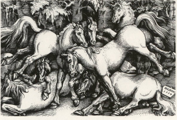
Wild Horses Fighting. BALDUNG The Metropolitan Museum of Art, Harris Brisbane Dick Fund

Through April 5 Ground floor East Building