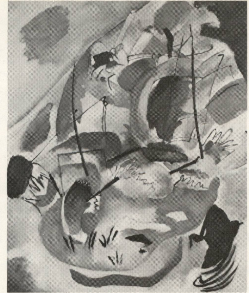
Improvisation 31 (Sea Battle). KANDINSKY National Gallery of Art, Washington Ailsa Mellon Bruce Fund

April 26 through August 2 Upper level East Building