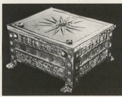
Gold chest found at Vergina. Archaeological Museum of Thessalonike. Copyright © 1980 by the Greek Ministry of Culture and Sciences/Copyright © 1980 by Manolis Andronikos.

Through April 5 Concourse level East Building