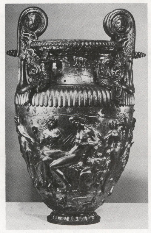
Bronze krater found in Grave Beta, Derveni Archaeological Museum of Thessalonike

The exhibition is organized to lead the viewer in a search for Alexander backward in time, through the imagery of his fame into antiquity and the Macedonian art of Alexander's own time and place. Among the highlights of the exhibition are gold and silver objects—including a wreath of oak leaves, a gilded silver diadem, armor, a gold chest, and