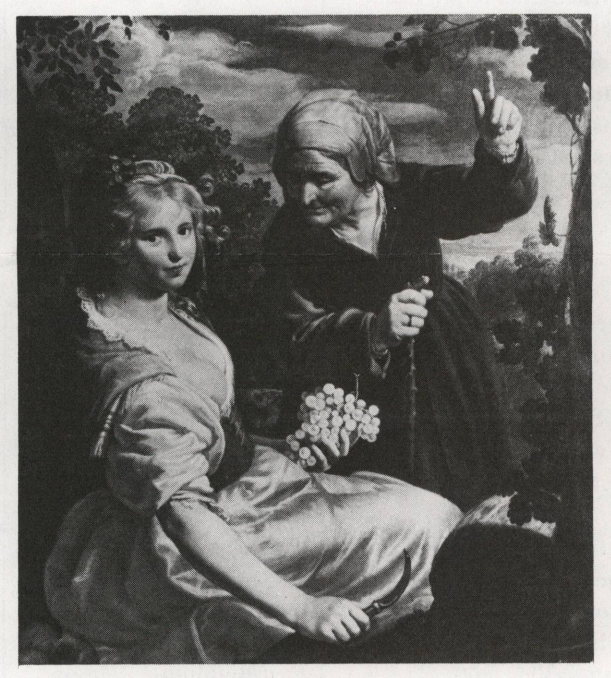
Vertumnus and Pomona. MOREELSE Rotterdam, Boymans-van Beuningen Museum

Through January 4, 1981 Galleries 43-51 West Building