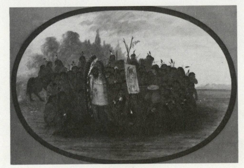
Catlin Painting the Portrait of Mah-to-toh-pa—Mandan. CATLIN