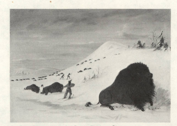
Buffalo Lancing in the Snow Drifts—Sioux CATLIN National Gallery of Art, Washington

Through December 31 Ground floor East Building