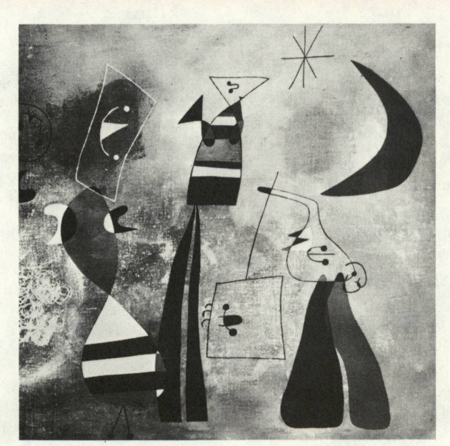
Painting (Personages and Blue Moon) (detail) MIRO The Morton G. Neumann Family Collection

A selection of approximately 140 paintings, drawings, watercolors and sculpture by major artists of the 20th century is on view from this private Chicago collection, considered one of the finest and most comprehensive in the U.S. This exhibition, the first to reveal the richness of the collection, includes significant examples of nearly every major movement in 20th-century art from cubism to pattern painting. The works are installed in 11 sections devoted either to movements or to individual masters. To illustrate European movements, cubist paintings by Picasso, Gris and Léger are on view; orphism, futurism