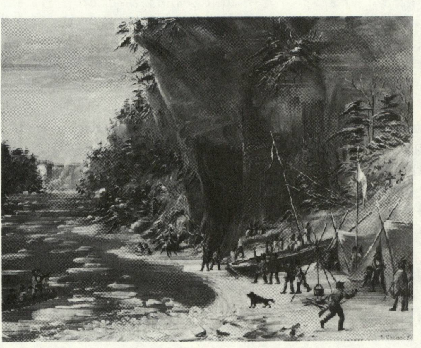
The Expedition Encamped below the Falls of Niagara, January 20, 1679 (detail) CATLIN National Gallery of Art, Washington

Powerful Indian portraits, scenes of ceremonies, hunting and other daily activities of the American Indian, as well as landscapes, comprise this exhibition of 53 finished oil sketches by the well-known 19th-century painter of American Indian life George Catlin. The paintings have been selected from over 350 given by Paul Mellon to the National Gallery in 1965. Most of them are from the 1850s "Cartoon Collection," painted on cardboard, which was easier to transport across the plains than canvas. Included is a series, never before shown at the Gallery, of 26 paintings depicting the voyages of the 17thcentury French explorer Robert Cavelier de La Salle. This series, commissioned by the French king Louis Philippe in the late 1840s, depicts La Salle's explorations over land and sea from Ontario to New Orleans.