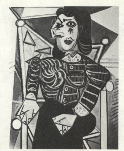
Seated Woman. PICASSO The Morton G. Neumann Family Collection

August 30 through December 31 Upper level East Building