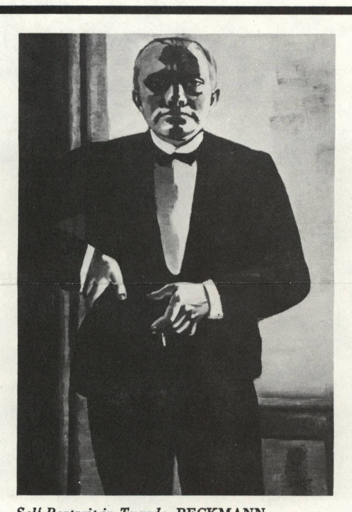
Self-Portrait in Tuxedo. BECKMANN Busch-Reisinger Museum, Harvard University

Through September 1 Mezzanine level East Building