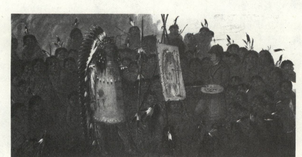
Catlin Painting the Portrait of Mah-to-toh-pa-Mandan (detail) National Gallery of Art, Washington

August 3 through December 31 Ground floor East Building