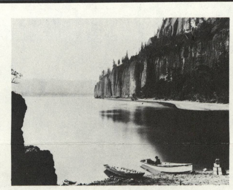
Columbia River, photograph. WATKINS Anonymous loan

Through June 15 Special Exhibition Galleries Ground floor, West Building