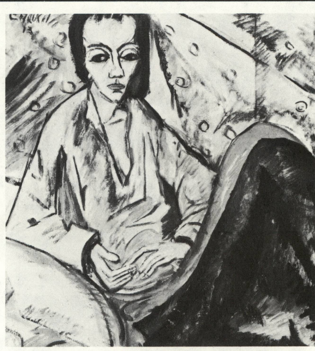
Center panel of Triptych: To the Convalescent Woman HECKEL Busch-Reisinger Museum, Harvard University

June 15 through September 1 Mezzanine level East Building