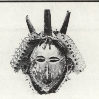
Mask from Papua, New Guinea Raymond and Laura Wielgus Collection

The Art of the Pacific Islands, extended four months beyond its original closing date, includes over 400 objects so fragile they may never leave their institutions again. Films through Sunday, February 17 will be shown daily and continuously from 12 to 3 p.m. in the small theater in the exhibition.