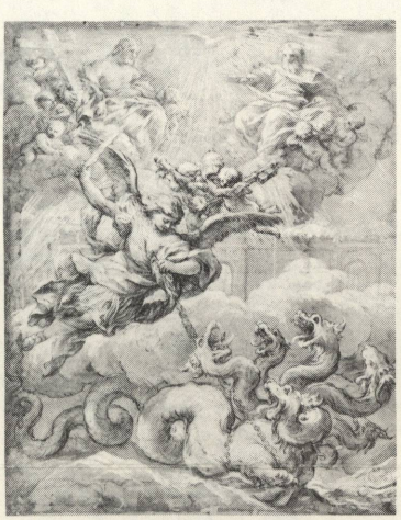
PIETRO DA CORTONA. The Holy Trinity with Saint Michael Conquering the Dragon The Art Institute of Chicago

Through March 2 Print and Drawing Galleries Ground floor, West Building