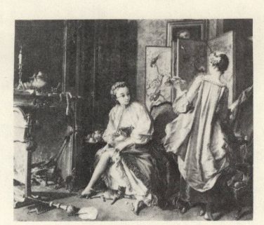
BOUCHER. La Toilette Collection of Baron Thyssen-Bornemisza

Through February 17 Mezzanine and Upper levels East Building