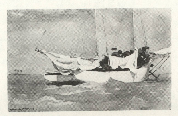
Key West: Hauling Anchor WINSLOW HOMER National Gallery of Art, Washington

A selection of 55 Christmas cards of paintings and prints in the Gallery's collection is available in the publications sales areas in both East and West Buildings. The subjects include The Rest on the Flight into Egypt by Gerard David, selected as the 1979 religious Christmas stamp. The 1980 Wall Calendar features 14 color reproductions from John James Audubon's "Birds of America." Also available are note folders and a selection of wrapping paper from the Index of American Design as well as a portfolio of color reproductions of six landscapes and seascapes by Winslow Homer.