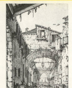
Capriccio: A Street Crossed by Arches CANALETTO The Art Institute of Chicago

December 9 through March 2, 1980 Print and Drawing Galleries Ground floor, West Building