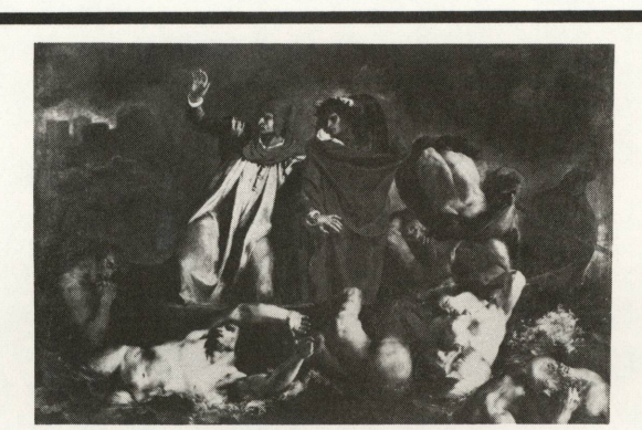
Dante and Virgil in Hell. DELACROIX

Through September 3 Gallery 93, West Building