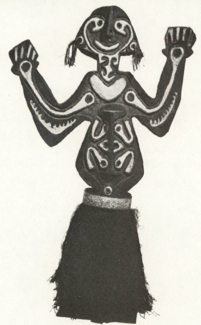
Painted wood figure with bark belt, fiber, and dagger ornaments From Papua New Guinea Lent by Bruce Seaman, Tahiti

Through October 14 Special Exhibition Galleries Concourse level, East Building