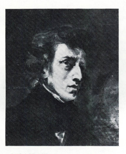
DELACROIX. Portrait of Chopin Lent by the Musée du Louvre, Paris

Through September 3 Gallery 93, West Building