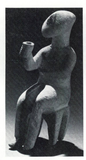
Small seated figurine N. P. Goulandris Collection

Through September 3 Ground floor, East Building