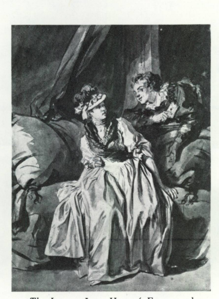
The Letter. Jean-Honoré Fragonard The Art Institute of Chicago

Through January 21, 1979 Graphics Exhibition Galleries West Building, Ground Floor