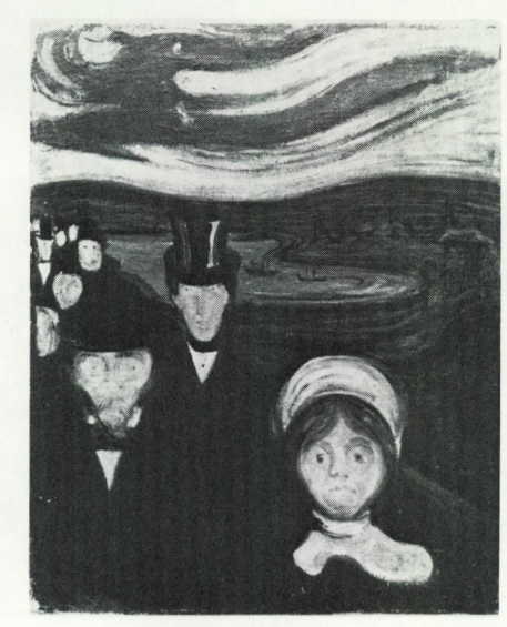
Anxiety. Edvard Munch Munch-Museet, Oslo

Through February 19, 1979 Special Exhibition Galleries East Building