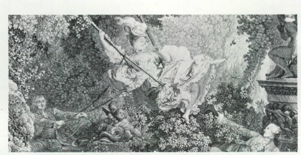
The Pleasant Dangers of the Swing (detail) Nicolas de Launay (after Fragonard) National Gallery of Art, Washington

Through January 21, 1979 Graphics Exhibition Galleries West Building, Ground Floor