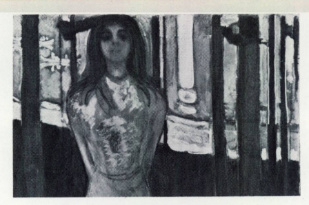
MUNCH. The Voice (detail) Munch-Museet, Oslo

Their Royal Highnesses Crown Prince Harald and Crown Princess Sonja are the honorary patrons of the exhibition.