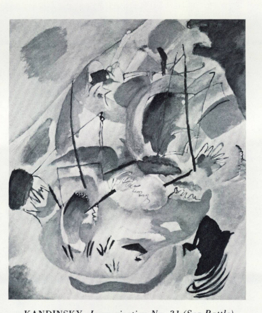
KANDINSKY. Improvisation No. 31 (Sea Battle) National Gallery of Art, Washington

Improvisation No. 31 (Sea Battle), a major work by Wassily Kandinsky (1866–1944), has been acquired by the National Gallery through the Ailsa Mellon Bruce Fund.