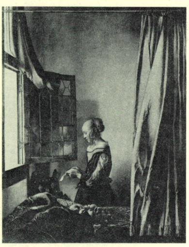
VERMEER Girl at a Window Reading a Letter Gemäldegalerie Alte Meister