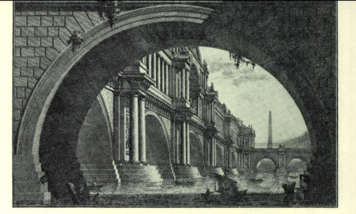
PIRANESI. Prima Parte: Ponte magnifico Ailsa Mellon Bruce Fund, National Gallery of Art

During September, films on contemporary architects and architecture will be shown in the East Building auditorium on Tuesdays through Saturdays at 12:30 and 2 p.m. and on Sundays at 1 p.m. Among the highlights is the thirteen-minute film documenting the construction of the East Building, produced for the Gallery by Charles Guggenheim, Washington, D.C., which will be shown the week of August 28.