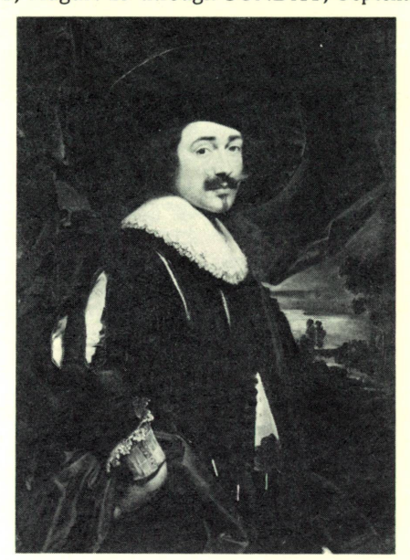
JORDAENS. Portrait of a Man

MONDAY, August 28 through SUNDAY, September 3