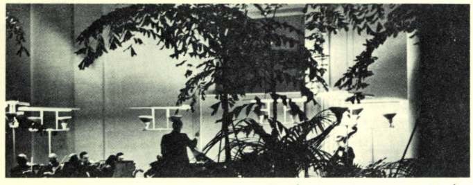
Sunday evening concert in the National Gallery's East Garden Court

The Splendor of Dresden: Five Centuries of Art Collecting, the major international loan exhibition from the German Democratic Republic, documenting the history of art collecting by the Saxon Electors over a 500-year period, will close at 9 p.m. on Labor Day, September 4. To avoid long lines, visitors are being given passes which admit them at specific times (but do not limit the length of time in the exhibition). These free passes must be obtained from tents on National Gallery Plaza.