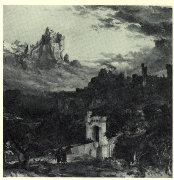
CROPSEY. The Spirit of War (detail)

MONDAY, September 11 through SUNDAY, September 17