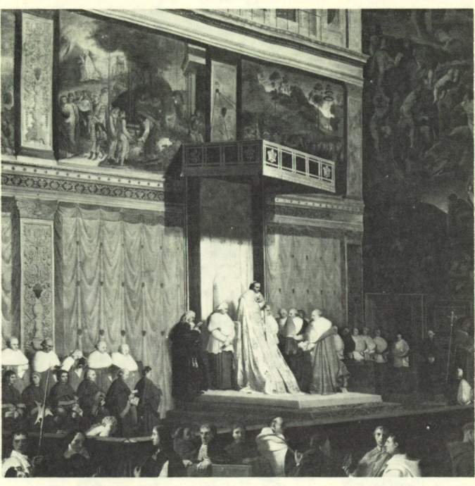
INGRES. Pope Pius VII in the Sistine Chapel (detail)

National Gallery of Art MONDAY, May 8 through SUNDAY, May 14