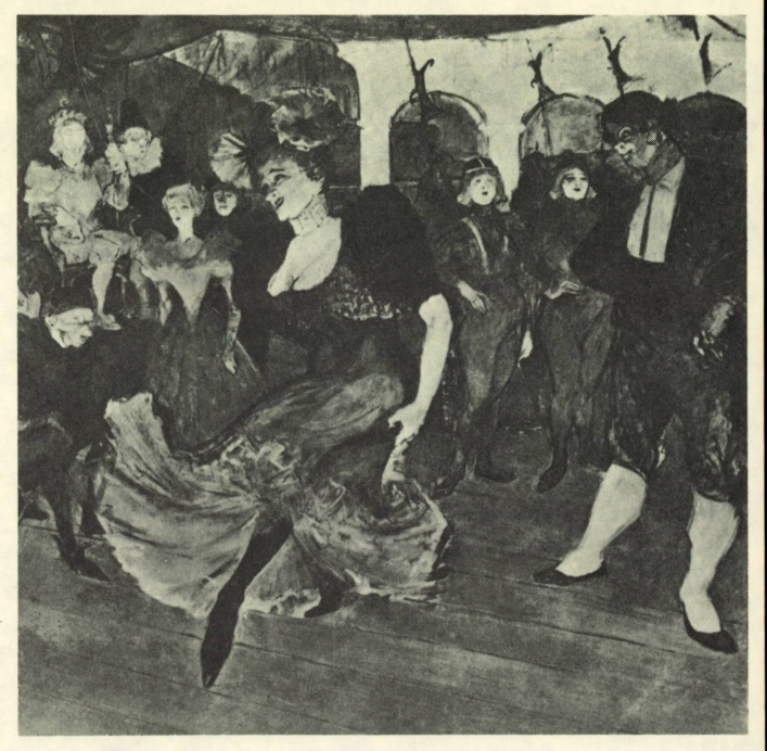
TOULOUSE-LAUTREC. Chilpéric (detail)