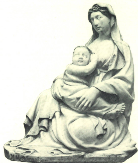
QUERCIA. Madonna of Humility