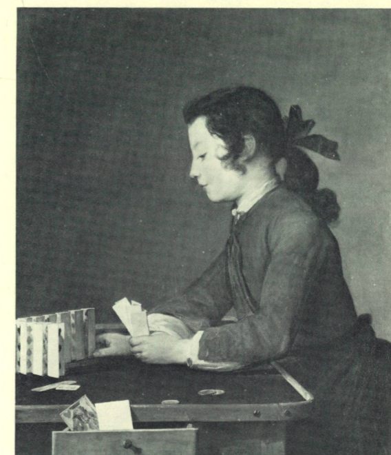
CHARDIN. The House of Cards