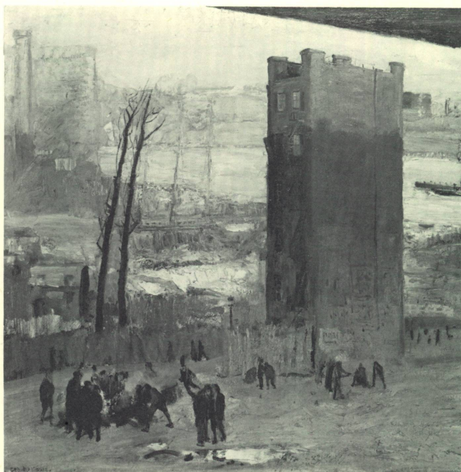
BELLOWS. The Lone Tenement (detail)

MONDAY, April 24 through SUNDAY, April 30