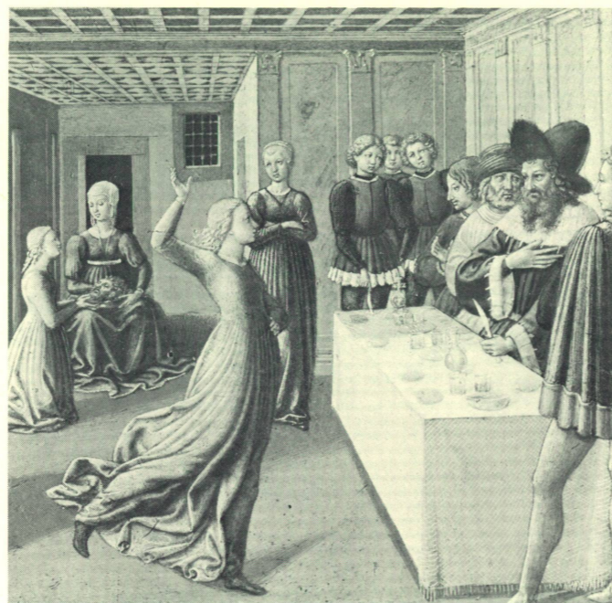
GOZZOLI. The Dance of Salome (detail)