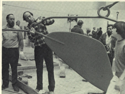
Hanging of the Calder mobile in the Gallery's East Building