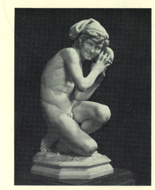
CARPEAUX. Neapolitan Fisherboy

MONDAY, February 20 through SUNDAY, February 26