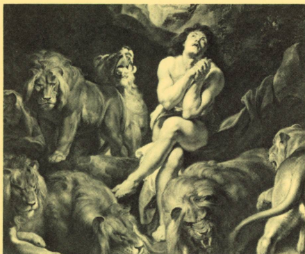
RUBENS. Daniel in the Lions' Den (detail) Ailsa Mellon Bruce Fund