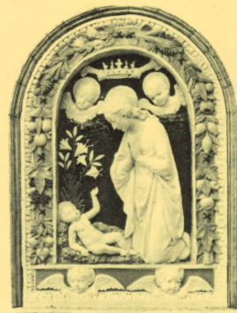
ANDREA DELLA ROBBIA. The Adoration of the Child (detail) Samuel H. Kress Collection