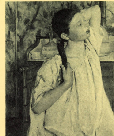
CASSATT. Girl Arranging Her Hair

MONDAY, November 21 through SUNDAY, November 27