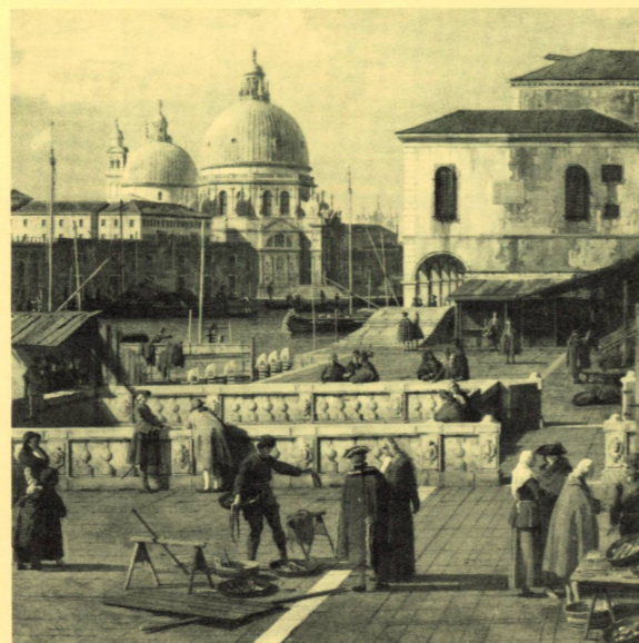
CANALETTO. Venice, the Quay of the Piazzetta (detail)

MONDAY, November 7 through SUNDAY, November 13