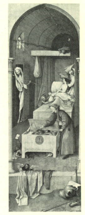
BOSCH. Death and the Miser