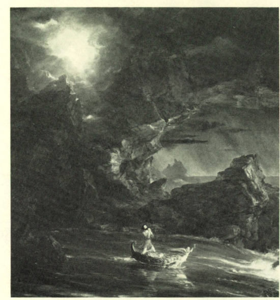
COLE. The Voyage of Life: Manhood (detail)

MONDAY, December 27 through SUNDAY, January 2