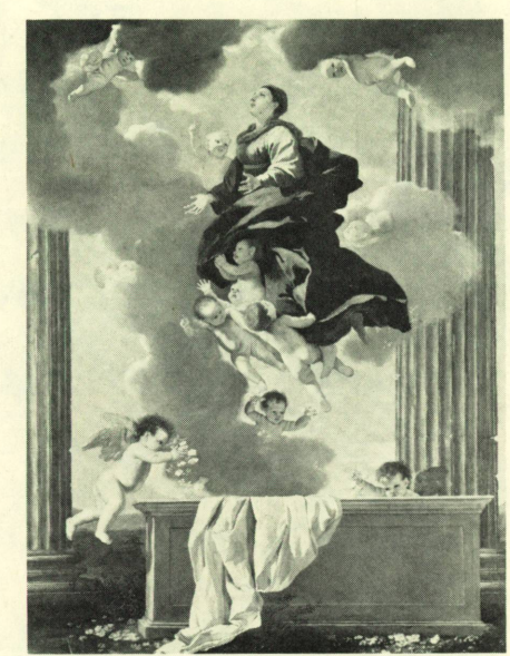
POUSSIN. The Assumption of the Virgin

MONDAY, January 3 through SUNDAY, January 9