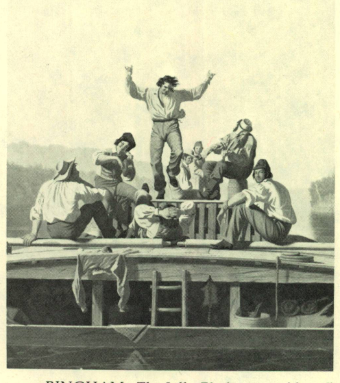
BINGHAM. The Jolly Flatboatmen (detail)

MONDAY, January 24 through SUNDAY, January 30