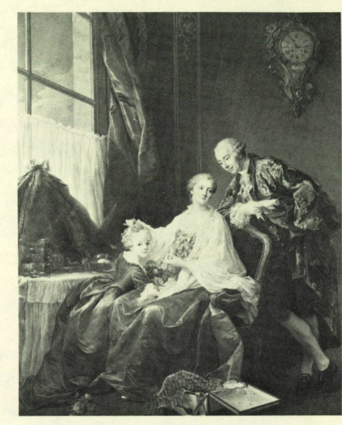
DROUAIS. Group Portrait

MONDAY, January 10 through SUNDAY, January 16