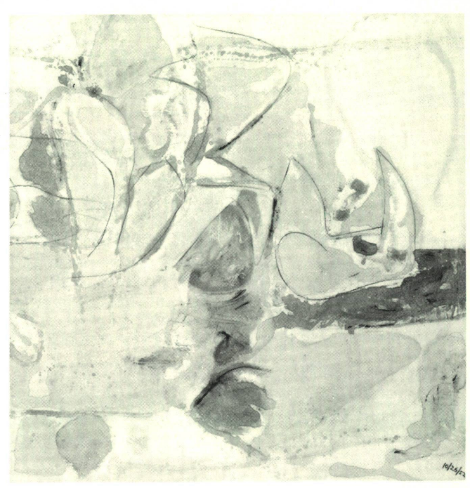
FRANKENTHALER. Mountains and Sea (detail)

MONDAY, November 1 through SUNDAY, November 7