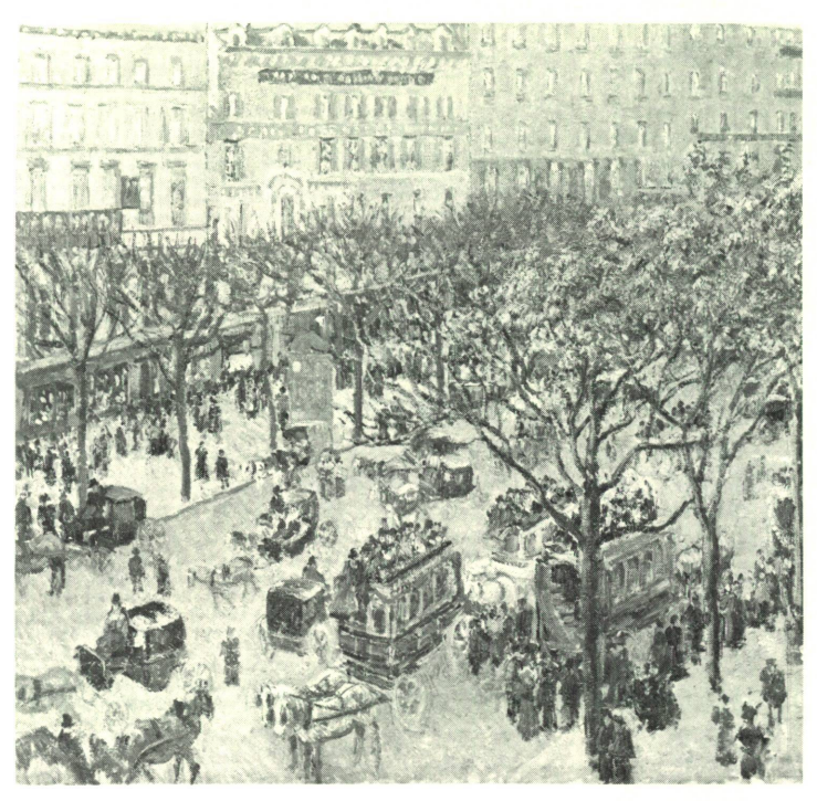
PISSARRO. Boulevard des Italiens, Morning, Sunlight (detail)

MONDAY, September 27 through SUNDAY, October 3