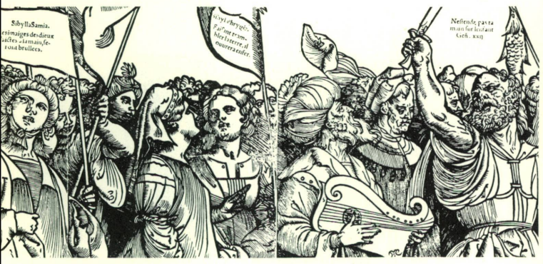
TITIAN. The Triumph of Christ (detail) Kupferstichkabinett, Staatliche Museen, Berlin