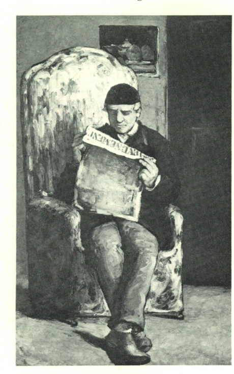
CÉZANNE. The Artist's Father

MONDAY, October 4 through SUNDAY, October 10