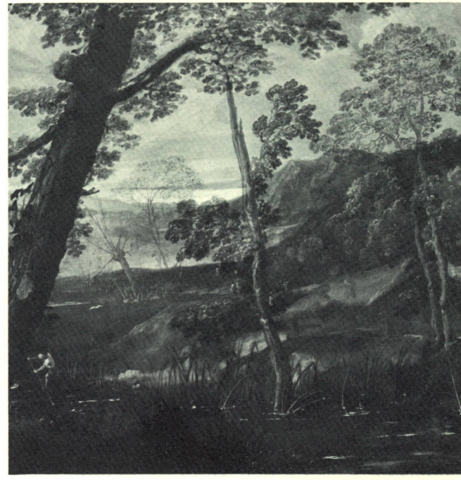
CARRACCI. Landscape (detail)