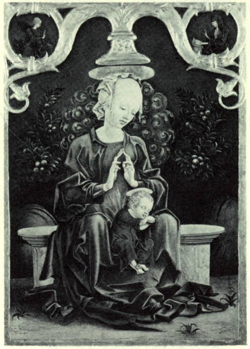
TURA. Madonna and Child in a Garden

Inquiries concerning the Gallery's education services should be addressed to the Education Office or telephoned to (202) 737-4215, ext. 272.